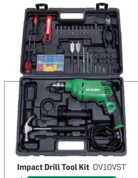
Impact Drill Tool Kit DV10VST

28 piece Accessory kit for various applications